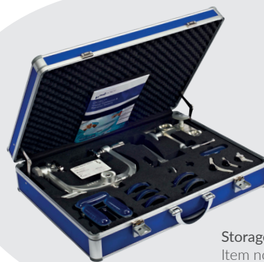
Storage Case MPSC System Item no. 3020-001 (shown with Multi-Purpose Skull Clamp and Accessories).