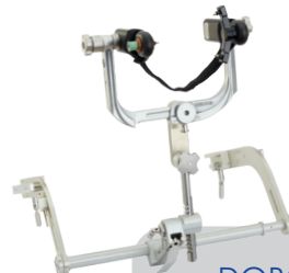
DORO® QR3 XTom Cranial Stabilization System Item no. 4002.100