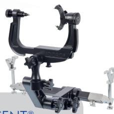
DORO LUCENT® Headrest System Item no. 1101.020 (page 20)