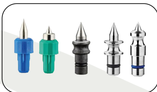
DORO® Skull Pin types

Results shall be documented below and the BFMG representative shall archive this document.