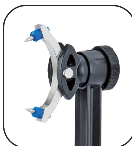
DORO® Pin Receptacles