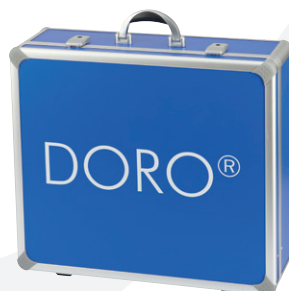
DORO® Storage Case Headrest System (optionally available) Item no. 1001.030