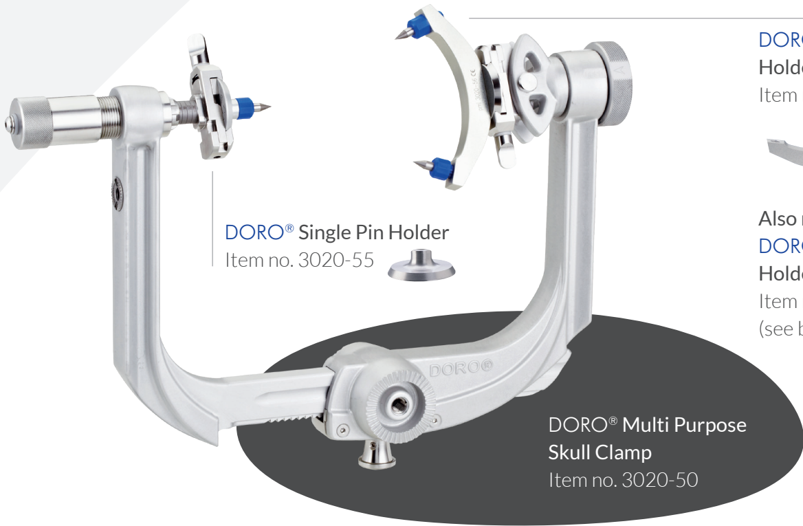
DORO® Single Pin Holder Item no. 3020-55