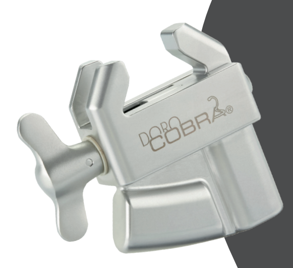
DORO COBRA® Quick-Clamp for Aluminum Quick-Rail® Item no. 1201.021

These adaptors allow the direct attachment of DORO COBRA® Flexible Rotary Arms to the Quick-Rail® of the DORO® QR3 Aluminum or Radiolucent Skull Clamp. This minimizes the obstruction of the surgical field, making it the tool of choice when maximum visibility is needed. They unfold the full potential of the DORO LUNA® Retractor System by allowing mixed set ups, providing the best set up solution depending on the particular situation. This may be of particular interest if budgets are limited.