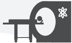
Magnetic Resonance Imaging

To gain quickly a very precise, 3-D view of certain parts, Computed Tomography (CT) can be used. Especially, in time-crucial situations such as an emergency or when treating older or anxious patients, CT is the best solution. It is also often applied to diagnose cancer determining the exact location and size of a tumor. The method can be further utilized for skeletal, high- and low-contrast as well as perfusion imaging.