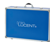
DORO LUCENT® Storage Case for Parallelogram Adaptors Item no. 4003.030