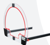
DORO LUCENT® iMRI Transfer Collision Indicator Item no. 4003.XXX