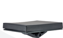
DORO LUCENT® Headplate Item no. 4003.005

With the first installation of a DORO LUCENT® iMRI Headrest System, an expert training is mandatory. Please contact your local DORO® representative for details.