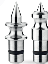
DORO® Reusable Skull Pins Stainless Steel (3 Pins) Ring-Color: Black Item no. 3005-00 (Adult) Item no. 3004-00 (Pediatric)