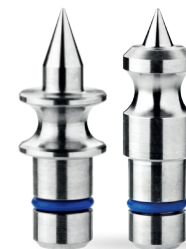
DORO® Reusable Skull Pins Titanium (3 Pins) Ring-Color: Blue Item no. 3005-50 (Adult) Item no. 3004-50 (Pediatric)